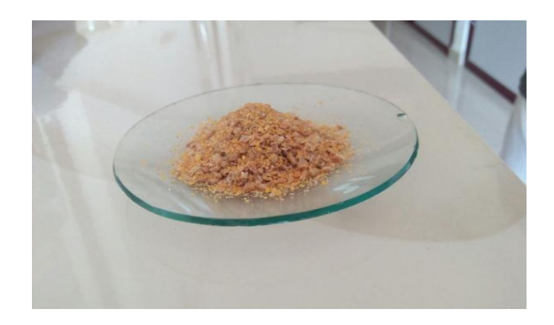
Fig. 1: Fenugreek seed extract

The finely grinded seed powder was taken. From the total extract 10gm of seed powder was taken and 50ml of ethyl alcohol was added to that extract stirred it constantly for 30 min and the solution was kept in room temperature for 24 hrs and then filtered. The filtered solution was stored at 4°C for further use.