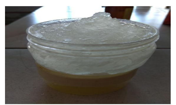
Fig No: 04 Herbal Gel

continuous stirring. Mixing was continued until a transparent gelwas formed.