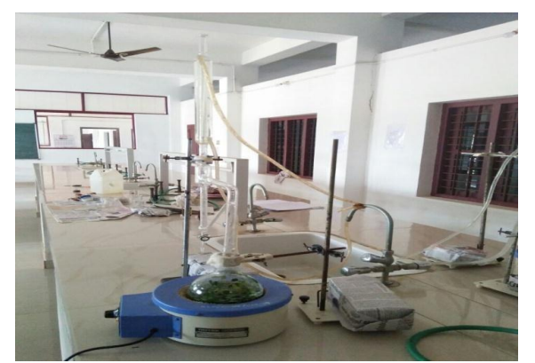
Fig No: 03 Soxhelt Apparatus

Twelve different herbal hair gel formulations were prepared by simple gel formulation preparation method with carbopol gel base. The gel formula contains methyl paraben, glycerine, triethanolamine, silicon, vitamin E. carbopol 934 two grams and measured quantity of extracts was dispersed in 80 ml of distilled water and mixed by stirring continuously in a magnetic stirrer. The measured quantity of glycerin triethanolamine, silicon, vitamin E was added to the mixture under continuous stirring. Mixing was continued until a transparent gelwas formed.