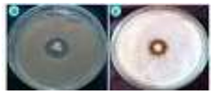
Zone of inhibition of ethyl acetate extract against pecillium and aspergillus species

Zone of inhibition of ketoconazole against pecillium and aspergillus specie